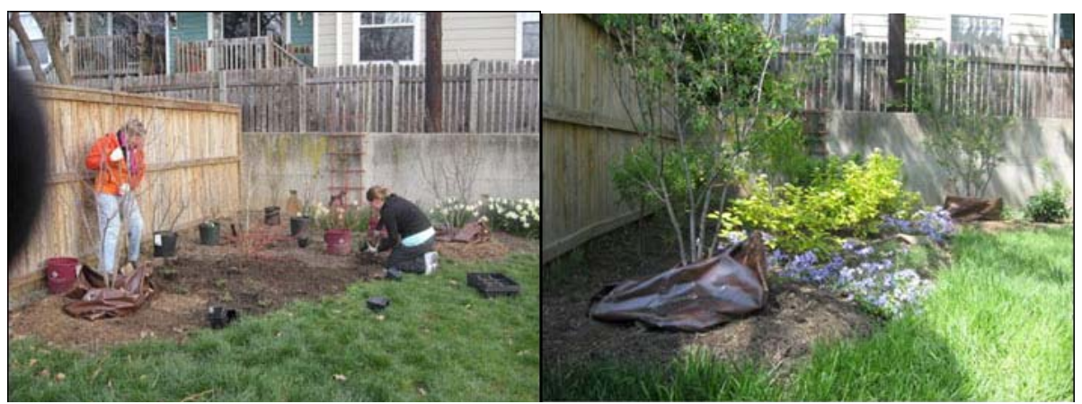
Figure 3.3.3. Demonstration sites exist throughout the District to promote downspout disconnection, removing impervious pavement, and promoting native plants.

(D-5) Filtration by Rain Gardens or Stormwater Planters. For some residential applications, front, side, and/or rear yard bioretention may be an attractive option used to filter roof runoff (see Figure 3.3.3). Stormwater planters are also a useful option to disconnect and treat rooftop runoff, particularly in ultra-urban areas. The designs for these options should meet the requirements of stormwater planters (B-4) or rain gardens (B-5), as described in Section 3.5 and summarized in Table 3.3.3 below.